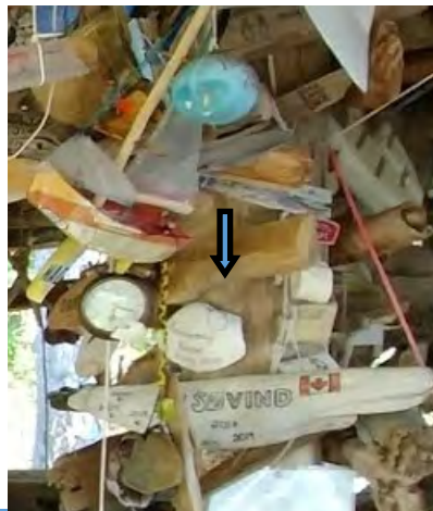
Kootenay Rose memory on shell in Octopus Marine Park museum. B Luterbach, 2020