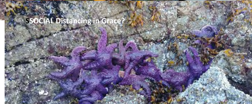
SSOCIAL Distancing in Grace?