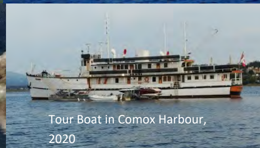
Tour Boat in Comox Harbour, 2020