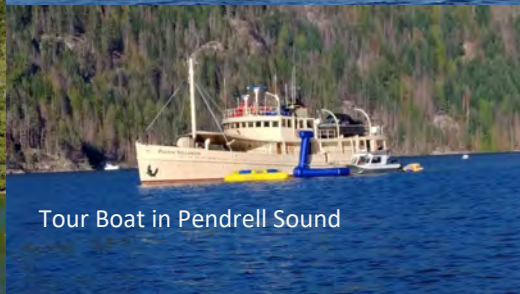
Tour Boat in Pendrell Sound