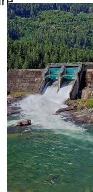
BC Hydro Dam, Salmon Inlet, Grant Watkins, 2020

We've been out a lot this summer. One new spot for us was to cruise Sechart, Narrows, and Salmon Inlets. Absolutely beautiful, and no crowded anchorages, even in a busy year elsewhere.