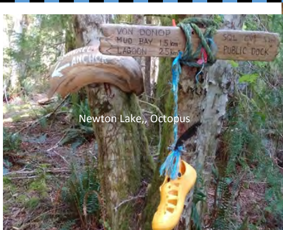
Newton Lake, Octopus