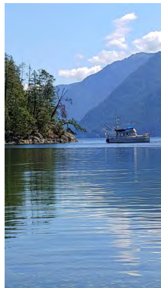
Cove at Kunechin Point; nobody there in July, Grant Watkins, 2020