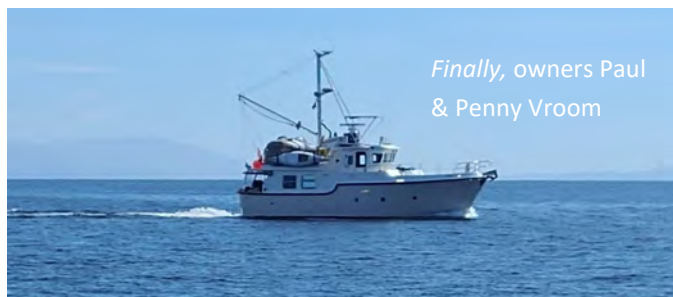
Finally, owners Paul & Penny Vroom