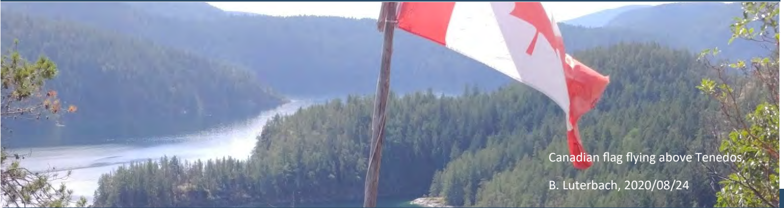
Canadian flag flying above Tenedos