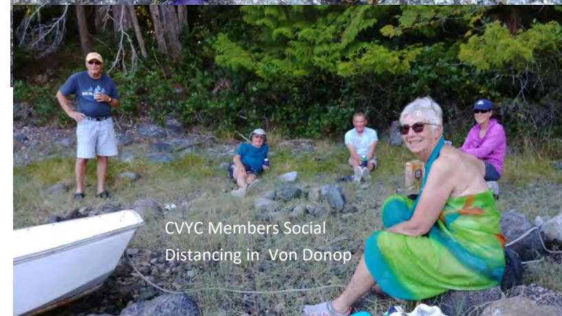
CVYC Members Social Distancing in Von Donop