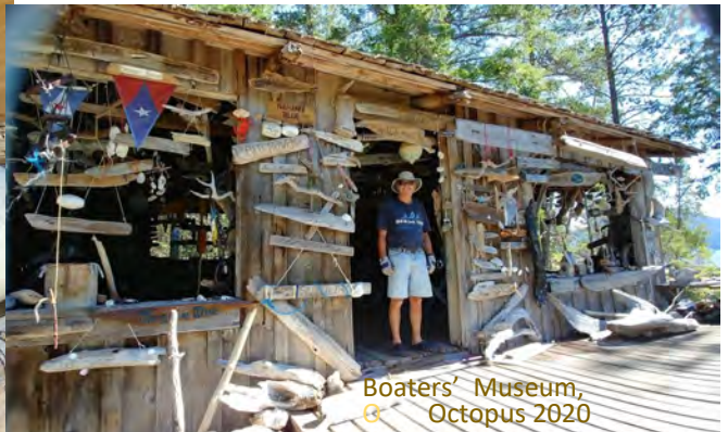
Summer 2020 Cruise memories: