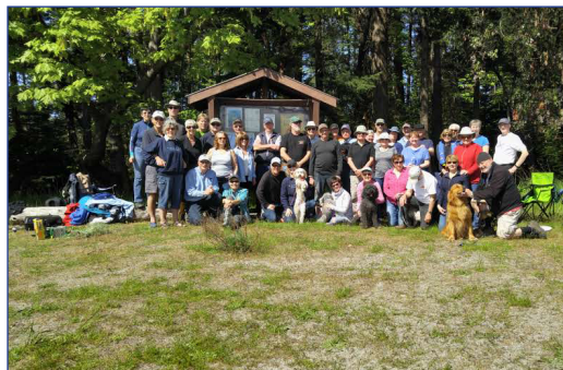
Past Years Sailpast, Tree Island Clean Up and BBQ